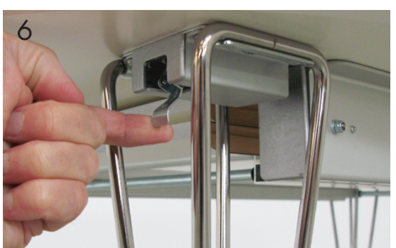
Lock the extension mechanism in both sides by pulling up the levers placed at the end of the guide rails underneath the table top.