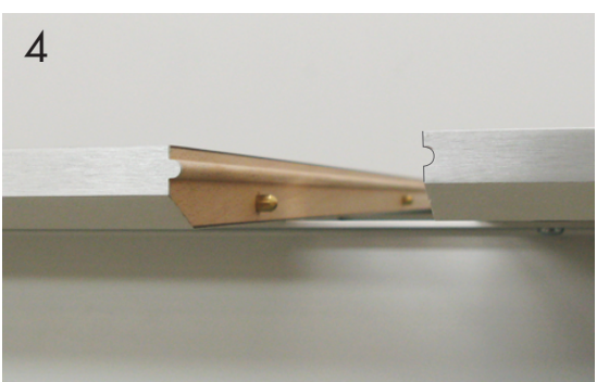
Place one or two extension leafs in the gap of the extended table. Make sure that the pins and holes are aligned.