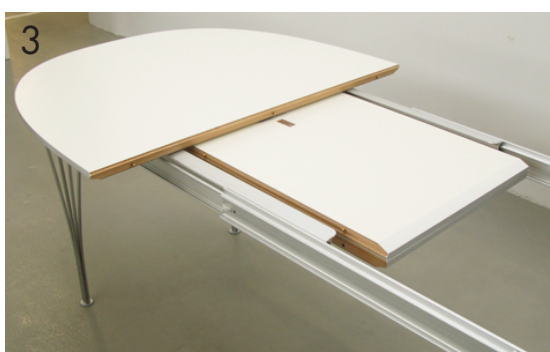
One person on each side of the table carefully lift both extension leafs from the holder.