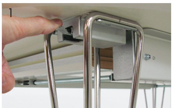
Unlock the extension mechanism by pushing down the levers placed at the end of the guide rails underneath the table top.

B 618 - B619 - B620 PIET HEIN/BRUNO MATHSSON